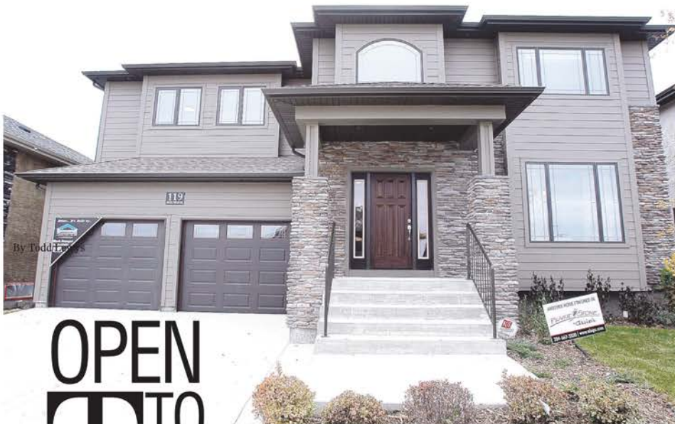
By Todd Lewys