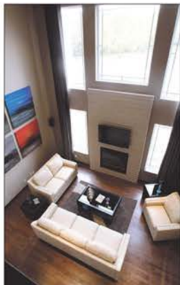
An 18-foot ceiling and full length windows make great room stunning.